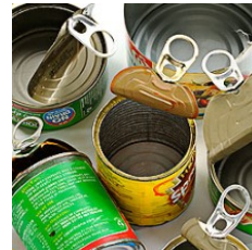
Aluminium Food Cans