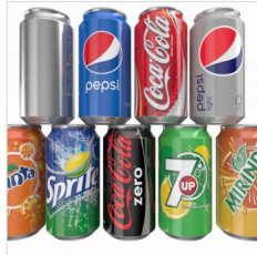
Aluminium Drink Cans