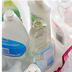
Cleaning Product Bottles