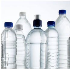
Plastic Water Bottles (no lids)