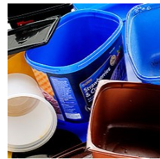
Ice cream & Yoghurt tubs