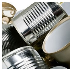
Steel Food Cans