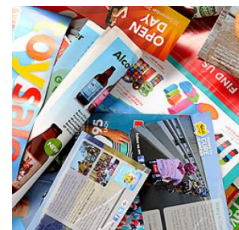
Glossy Magazines, Wrapping Paper, Junk Mail