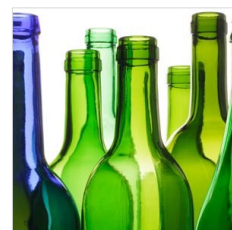
Wine & Alcohol Bottles (no lids)