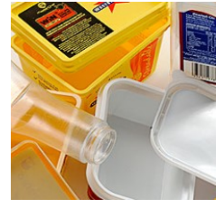
Marg, Butter, Dressing Containers