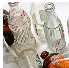
Glass Bottles (no lids)