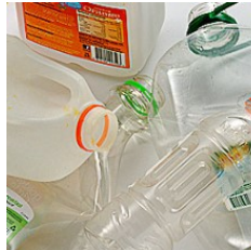
Plastic Milk/ Juice Bottles