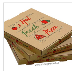
Pizza Boxes (no scraps)