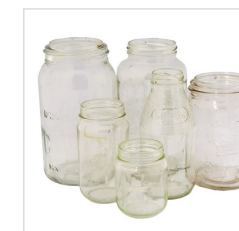
Glass Jars (no lids)

YOU CAN ALSO RECYCLE - egg cartons, envelopes, phone books, poppers & long life cartons, oil, sauce, vinegar, alcohol & medicine bottles, chocolate/biscuit tins, CD covers, motor oil containers (must not have any oil residue).