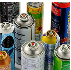
Hairspray, Insect spray, Aerosols (nozzles removed)